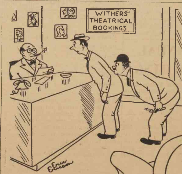
Reprinted from May 1951 issue of Esquire

In discussing the program now in operation with the Western Electric corporation, the college administrative officials expressed the hope that similar projects may be possible in the not-too-distant future with other industrial concerns in this area of North Carolina, since such a plan offers possibility of benefits to the company, to the college itself and to the individual students.