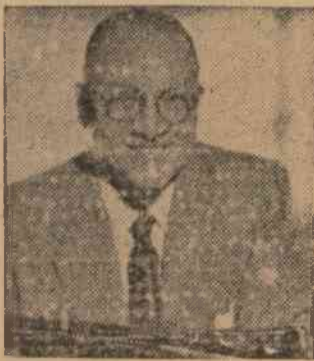
PEE WEE HUNT

Pee Wee Hunt and his 12th Street Rag Band will furnish the music for Elon's annual May Day Dance, which will be staged in Alumni Memorial Gymnasium at 8 o'clock Saturday night. The dance committee and its workers have been busy all week with elaborate decorations for the gym, and the dance promises to be one of the outstanding events of the campus year.