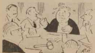
"Politicians are like old trousers; they only come clean in hot water."

Mainly, I was annoyed with B.O.B. back in the Forties because it met on Monday nights. That meant I couldn't see the girl I married. That was the biggest adjustment I had to make in wedded life. I couldn't believe that there my wife was for me, Monday nights and all.