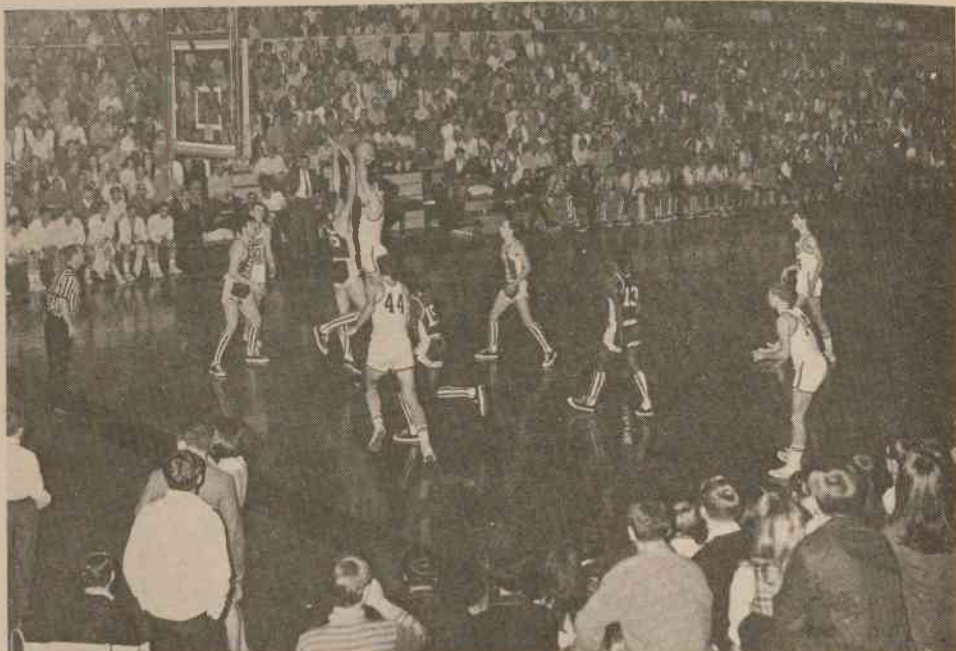
It may have been the largest basketball crowd in Elon College history that packed into Elon's Alumni Memorial Gymnasium to watch the Christians drop a heart-breaker to the High Point Panthers on Saturday night, January 18th, for the gym came nearer to being filled to capacity than at any other game since it was first put to use in January of 1949. The above picture shows a portion of the crowd, which was so large it was necessary to pull out the end seats on the first floor. Attendance was estimated at from 4,000 to 4,200 persons.