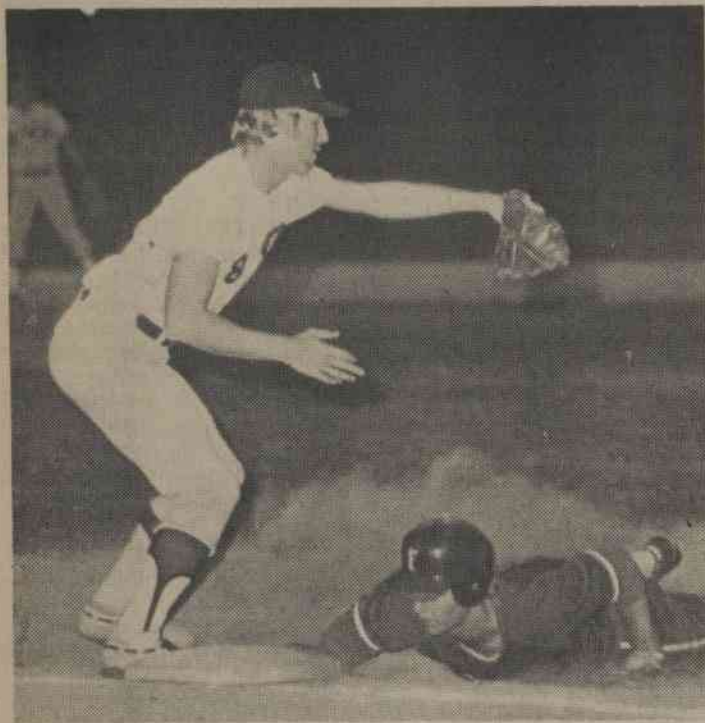
SAFE! The Elon College Fighting Christian baseball team has won 12 out of 20 starts. The Christians will meet the Catawba Indians tomorrow away at 7:30 p.m.

The Fighting Christians hope to be competitive in this, their first summer league season.