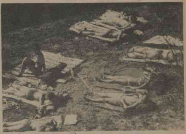
Nothing like a bunch of bathing beauties to brighten up a day! The spring weather always seems to bring out the best in people, and from one end of campus to the other, sunshine and smiles tell the story.