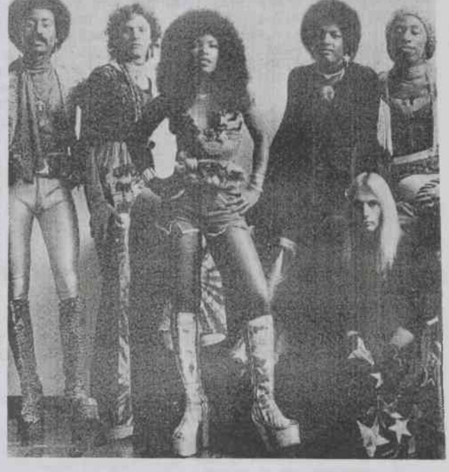
They call themselves "Mother's Finest" because they play nothing but the best; packed with energy and loaded

will be assigned to the remaining rooms, students desiring rooms on campus must complete sign-up before the April 14 deadline.