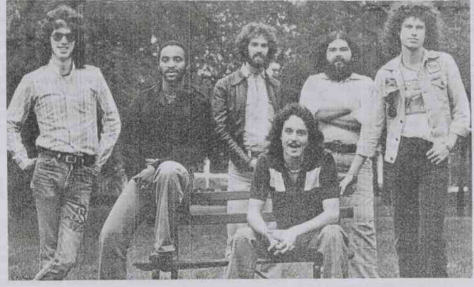
Wet Willie under the Capricorn label recorded three albums, "Dixie Rock," "Wetter the Better," and "Left Coast Live."