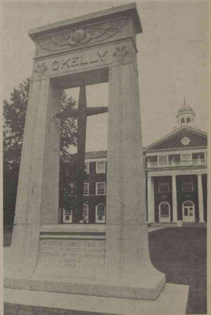
The O'Kelly monument in the Quad will be the site of a press conference of the Public Interest Research group [PIRG] today at 1:30 p.m.