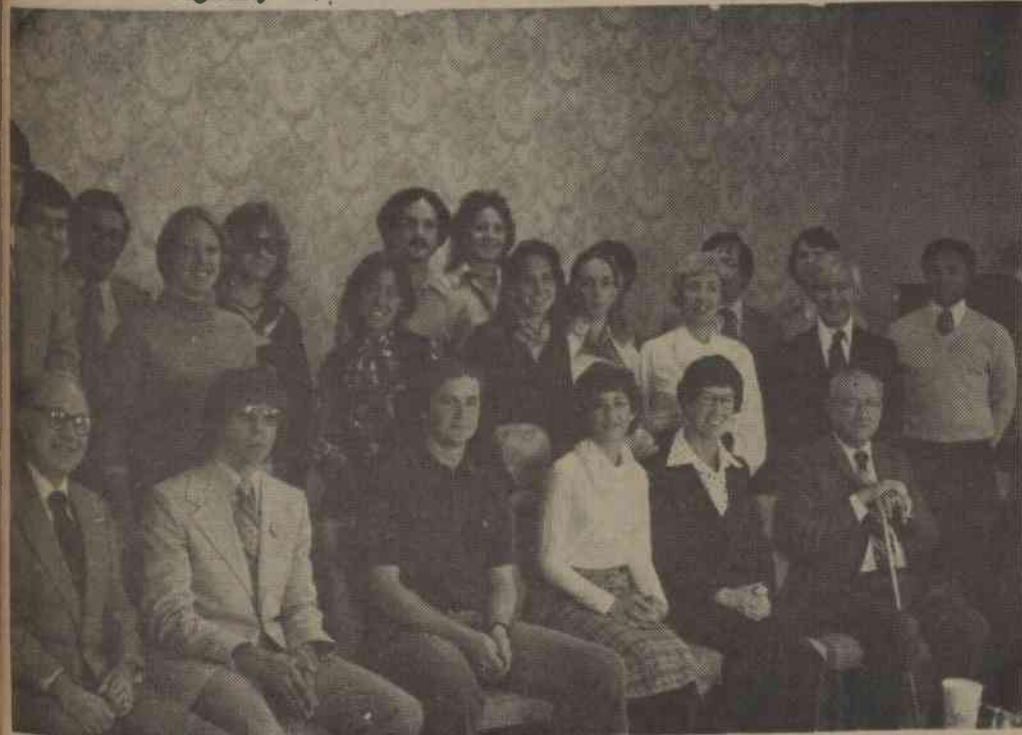
The oldest honor society at Elon, Pi Gamma Mu, celebrates 50th anniversary.