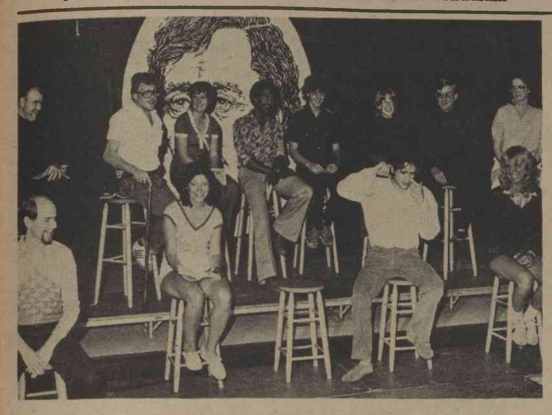
The Cast of The Night Thoreau Spent In Jail.