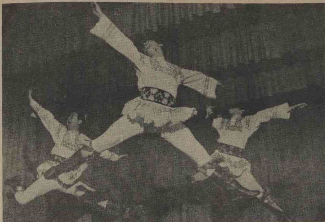
Rumanian Folk Dancers in their native costumes entertained an enthusiastic audience at Williams High School recently. The program, free of charge to all Elon students and faculty, was the first of a series of concerts sponsored by the Alamance Community Concert Association.