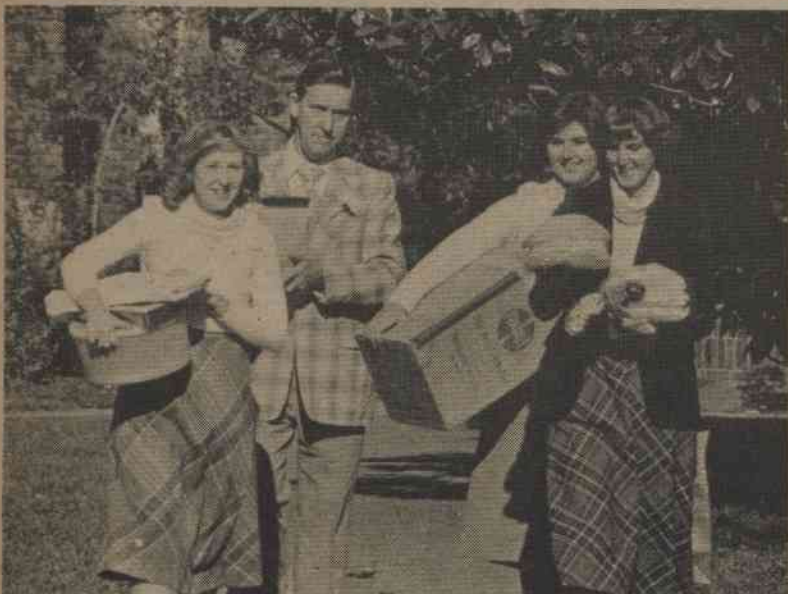
The arrival of parents usually means a "care package" and a smile from home. Parent's weekend looks like a success according to these students' smiles and armload of home.