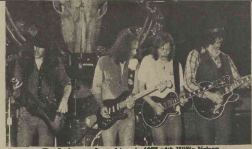
The Outlaws performed here in 1977 with Willie Nelson.

The recent Anti-Suitcase Weekend that featured three