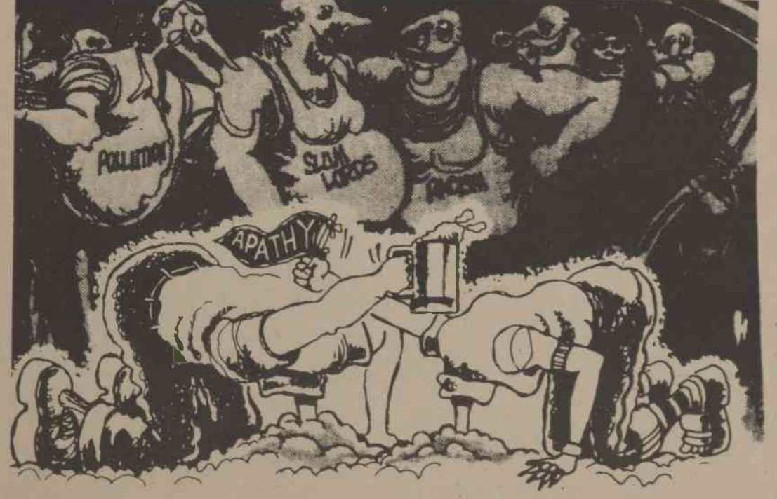
It sure is nice to see them college students behaving themselves again!

The Pendulum welcomes letters, limited to 250 words, from our leaders. Longer material may be submitted as opinion articles for page 3. Editors reserve the right to edit for length, libel, good tast and accuracy.