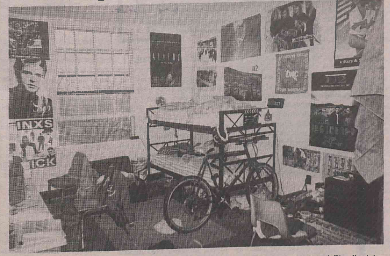
Concern: Bigger residence hall rooms.