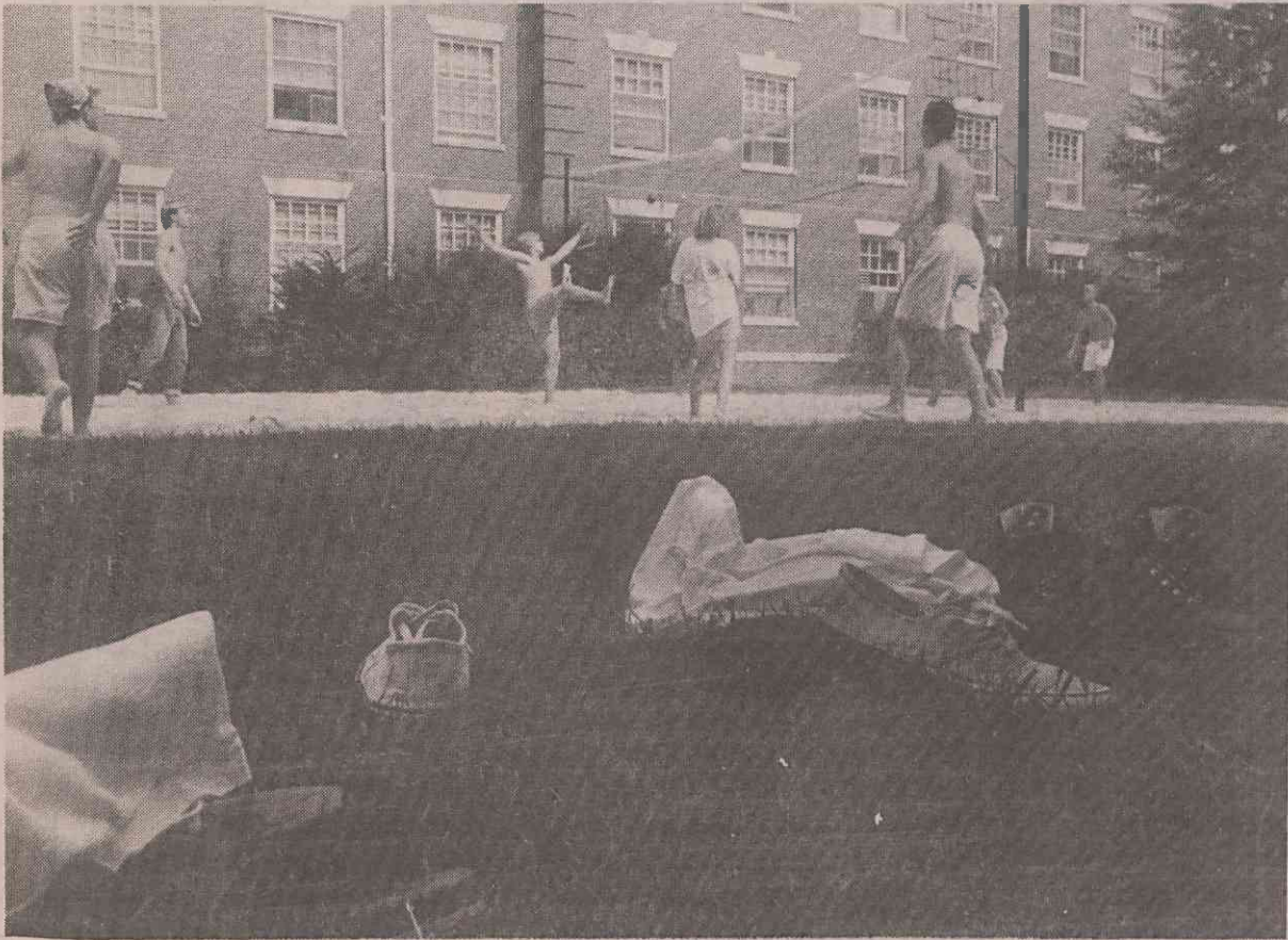
Elon students make the most of their free time