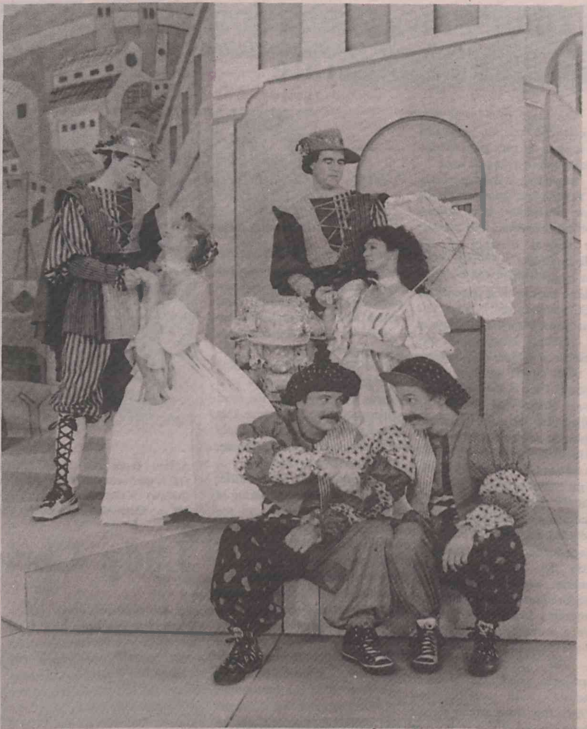
Shakespeare Festival performs "The Comedy of Errors"

Admission to Comedy of Errors is by ticket only. Tickets are $10 and are available at the Fine Arts Building box office from 12:30-5 p.m. Monday - Friday.