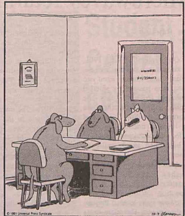
"You should hear him! . . . First he howls and growls at me and then he thinks he can make everything OK by scratching me behind the ears."