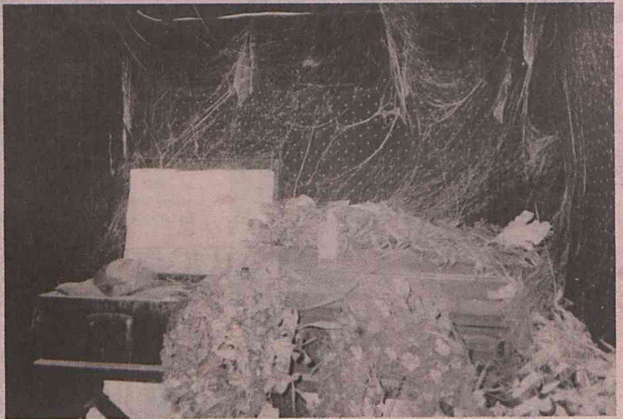
Cobweb covered illusions surround the mannequin that lies in state in the crypt room.