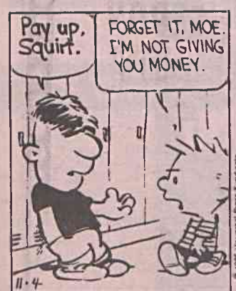
IN FACT, I DON'T EVEN HAVE ANY.