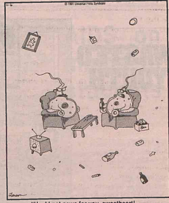
"Hey! I got news for you, sweetheart! . . . I am the lowest form of life on earth!"