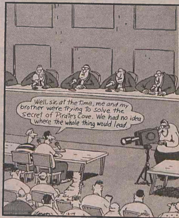
Testifying before a Senate subcommittee, the Hardy boys crack the Iran-contra scandal.

TAKE THE KEYS. CALL A CAB. TAKE A STAND.