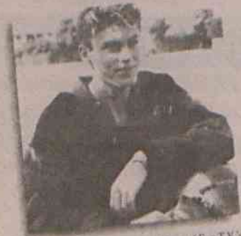
Brian Austin Green of Fox TV's Beverly Hills, 90210

From 90210 to your zip code, a Motorcycle RiderCourse can make you a better, safer rider. Call 1-800-447-4700 today to become the star of your class.