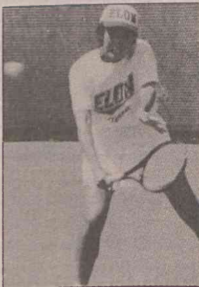
Women's tennis backhanded Mars Hill in their final home match.

The Lady Christians will travel to Wingate this weekend to begin the Food Lion SAC Tournament.