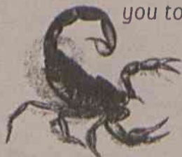
The Scorpion can survive more than desert heat-like being frozen for over a week.

One step inside and the dry air makes you feel like you're somewhere south of Tucson. Live 1,000 lb. saguaro cacti act as tour guides as they point you toward the elusive roadrunner