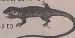
Whiptail lizards constantly search for food. They'll even dig underground for a meal.

Just up ahead, down a dark, narrow path, day turns to dusk and the desert night comes alive.