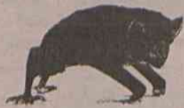
Vampire bats don't always fly, but crawl and hop to within striking distance.

different species of plants and animals, tons of rocks, some sand, and one very important watering hole.