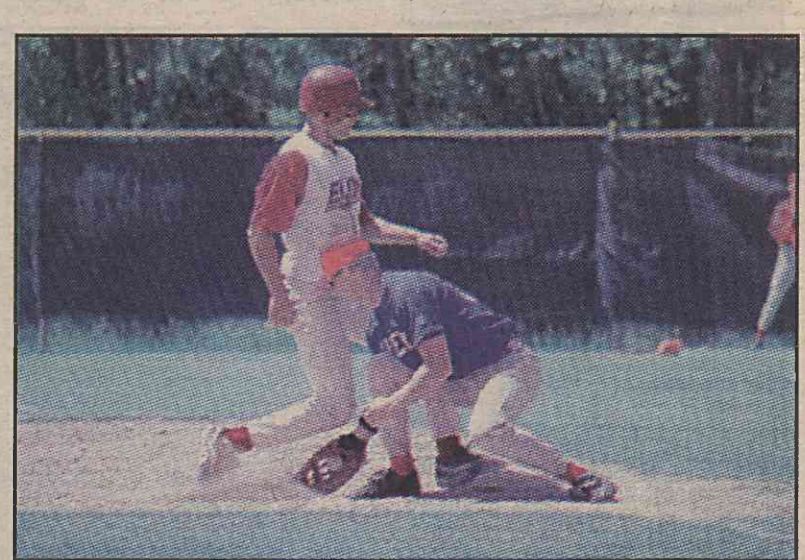
Baseball beats No. 21 East Carolina 4-3 in 12 innings. Story page 27.

"It was like the Final Four for us. Some seniors and juniors have lost to them for two and three years. They (ECU) are just so obnoxious. I've never seen a team pull together like that. It was the greatest win we've ever