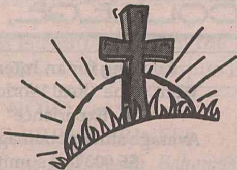
sponsored by Antioch Community Church

That's what Celebration is... Every Sunday, 10:30am, Moseley Practically in your backyard!