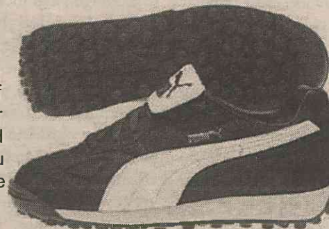
athletic shoes at puma.com

were on puma.com, fila.com and asicstiger.com. If you need a cute athletic watch go to nike.com, though they don't have the best of sales, or timex.com, and make sure you check out the