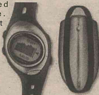
The many futuristic designed watches at nike.com

watch with the special lap timer if you are a runner. If