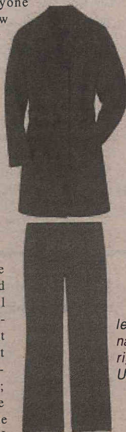
left: jacket, Old navy; pants, GAP; right: jacket, UrbanQ

Anyone notice how the weather decided to drop five million degrees the past few days? Many of us left our warmer clothes at home because we didn't think we would need them until Thanksgiving. That thought isn't too unreasonable; I mean we are in the south. It seems like the cold front came with no warn-