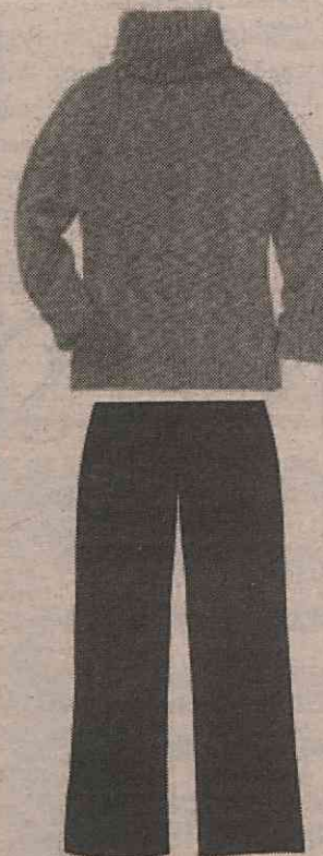
left: sweater, GAP; pants, UrbanQ

ommend coming to them with complaints. What are college students supposed to do when a crisis like this occurs and we are freezing with no warm clothes? Trying to find stylish, unique clothes in Burlington is like searching for an unpainted cup in a Greek girl's kitchen. No fear my freezn' friends, there are so many inexpensive sweaters, jackets, sweatshirts and long pants that are ON SALE right now. But you can only find them online.