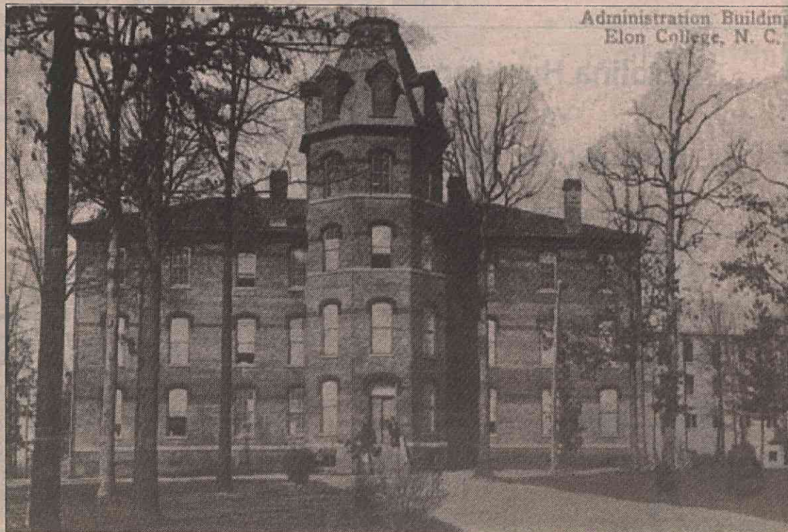
Main administration building prior to 1923.