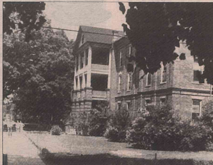
West dormitory in the 1950s.