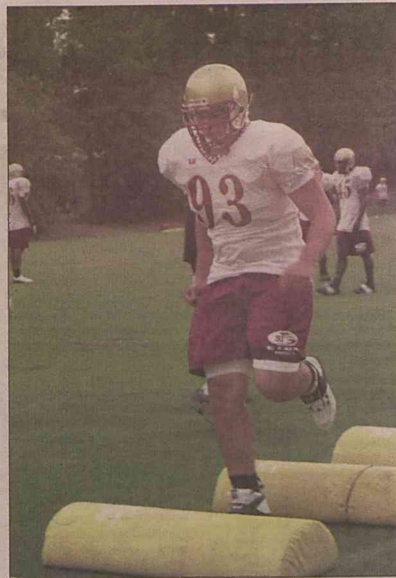
An Elon athlete runs through agility drills to quicken his footwork.