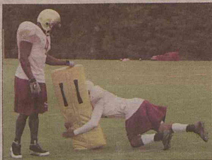
A Phoenix player practices the proper tackling technique.