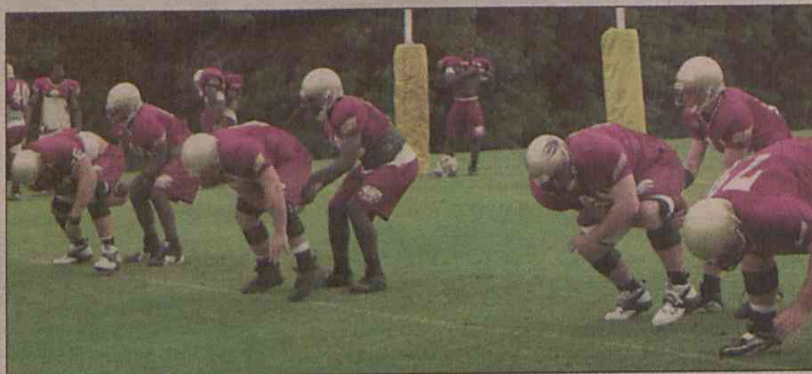
The Phoenix football squad runs quarterback drills to balance this season's offensive attack.