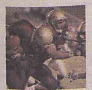
Is it time for a change?

Columnist calls on Phoenix football coach to make change at quarterback.