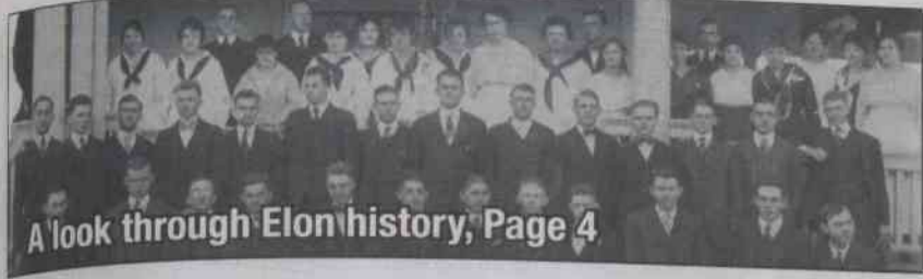
A look through Elon history, Page 4

Students choreograph performance for festival, Page 13