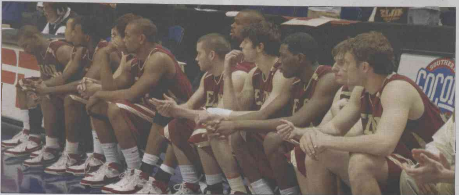
The men's basketball team watches anxiously from the bench as the final minutes of the Southern Conference final tick down.