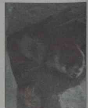
A river otter at the North Carolina Zoo in Asheboro plays in his cove at a special exhibit.

Hours of operation are 9 a.m. to 5 p.m. from April 1 to Oct. 31. Plan on spending four to six hours walking through the vast park. Animal status boards provide feeding time information upon entering.