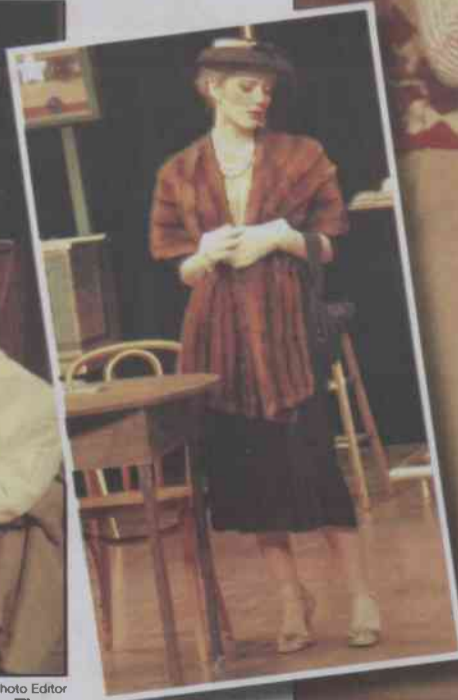
Student actors perform William Sayoran's "The Time of Your Life" in the Black Box Theater. The Pulitzer-winning play ran from February 3-6.