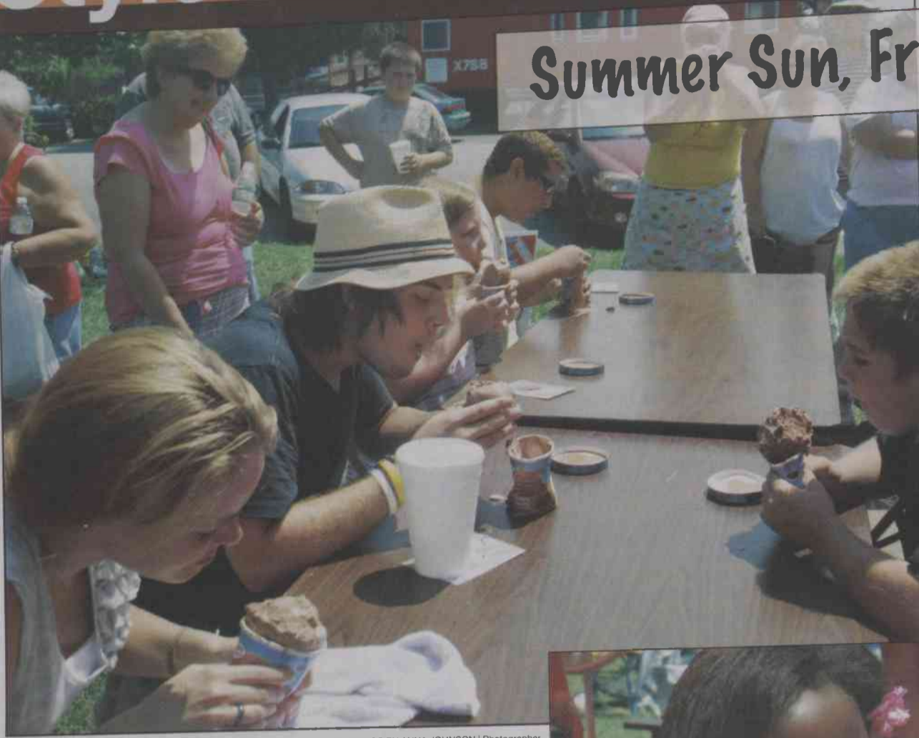
Less than three miles from Elon University, Gibsonville held its first Ice Cream Eating Contest. The event was hosted by Scoops Express, located at 203 E. Main St. Three ice cream contests were held for different ages: 6 to 10 years-old, 11 to 18 years-old and +19 years.