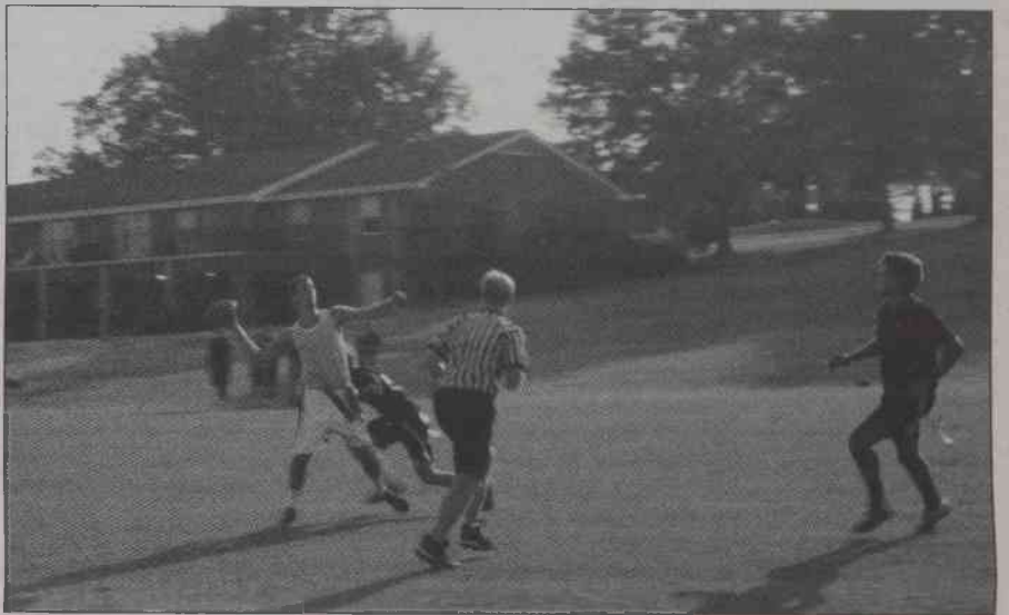
The Kappa Sigma and Sigma Chi fraternities go head-to-head in an intramural flag football game. The two teams are in one of 13 brackets in intramural flag football competition, which are classified as men's, women's, coed and Greek and are made up of between three and five teams.