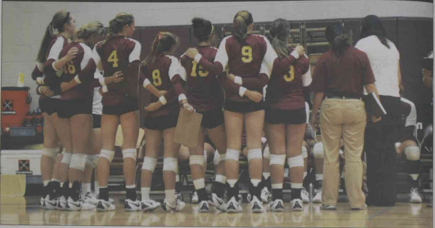
The Elon University volleyball team recorded 38 kills and 49 digs against the University of Tennessee Chattanooga in its 3-0 win Sept. 26 — the second Southern Conference win in as many matches.