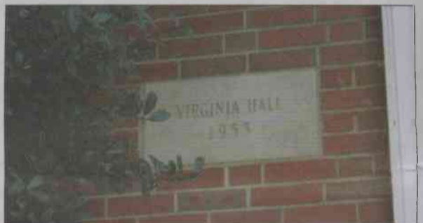
As new construction projects continue on campus, Elon is taking steps to preserve the safety and tradition of older buildings.