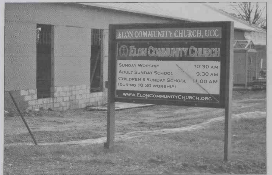
Officials at the Elon Community Church hope to have the expansion of their facilities completed in time for Easter Sunday next year. Construction was delayed but is now back on track.