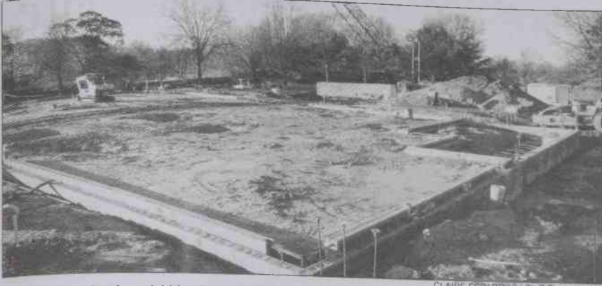
The foundation has been laid for the expansion of Moseley Center, expected to be completed by January 2013. The project will double the building's size and create the largest dining hall on campus.