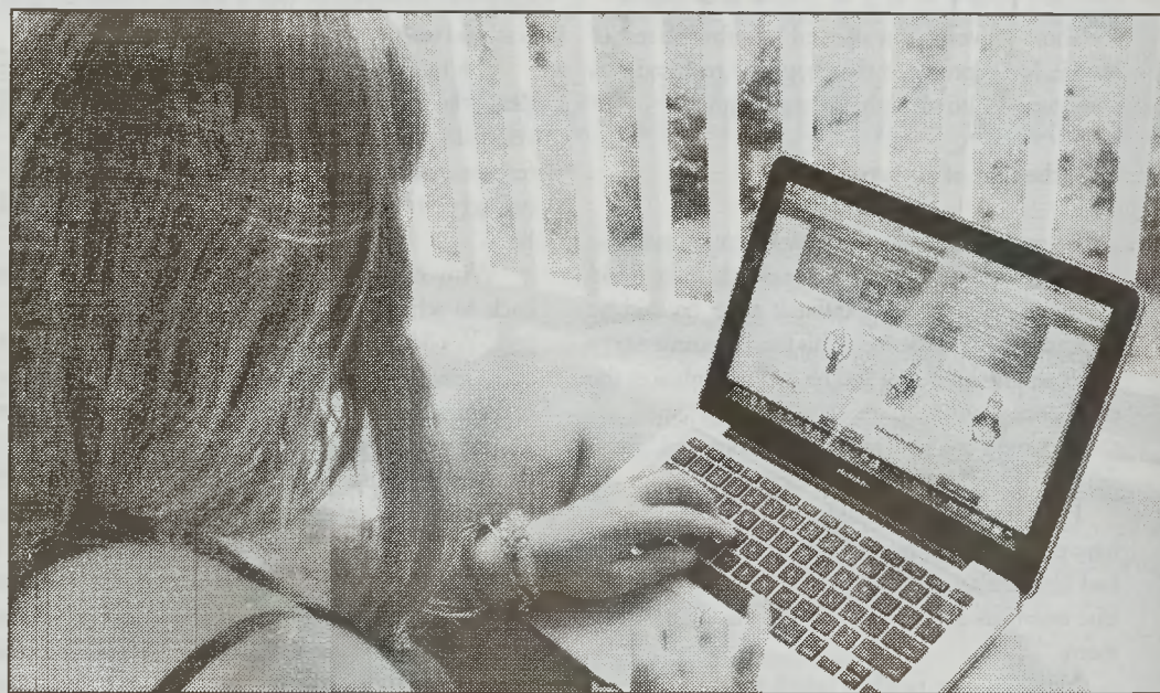
Campus Grumble is available at only four universities, including Elon. It is designed to give students a place to file complaints that administrators have access to and have already agreed to check regularly.

Kirkpatrick travels to campuses to meet with administrators and ensure the site is working properly. He knows it is essential to account for how different administrations function. He focuses on showing the administration the website's convenience. Beyond a platform for students to complain, it is also a place for potential students to learn about