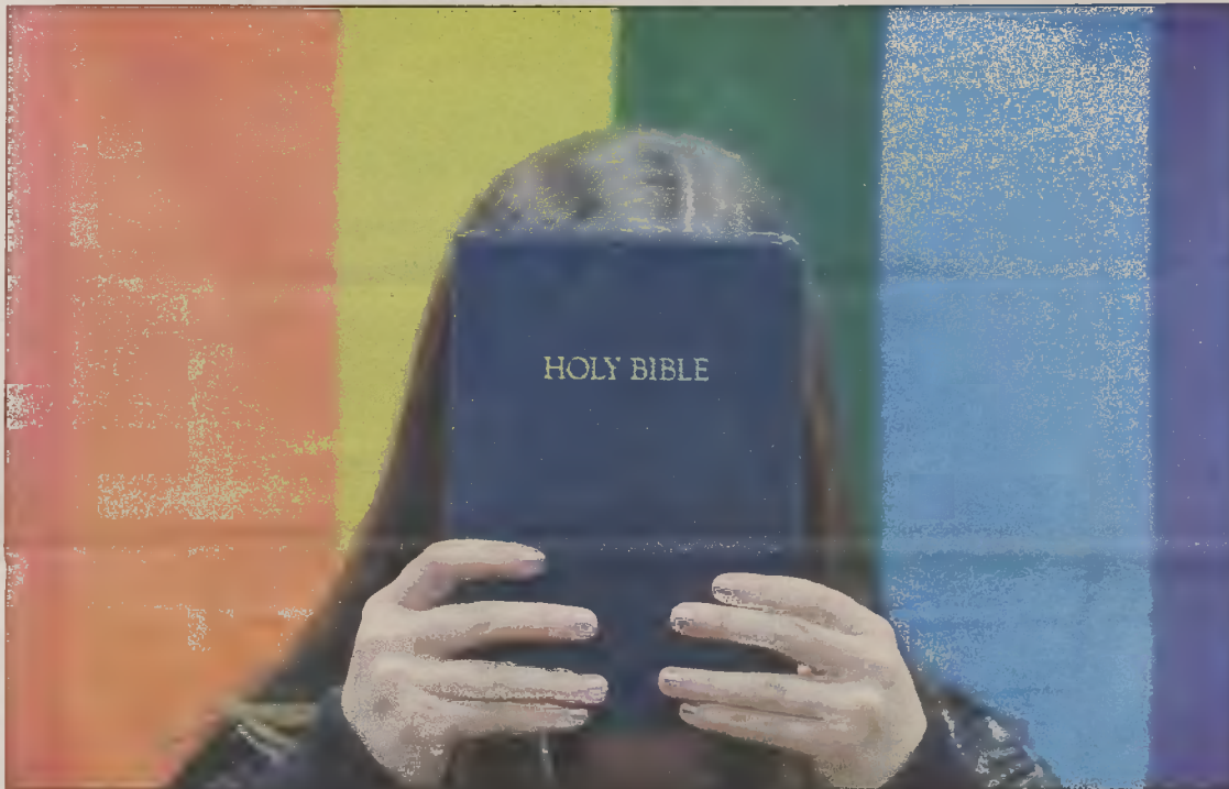
Open and Affirming churches are on the rise nationally. These institutions fully accept LGBTQIA people within their ministries.