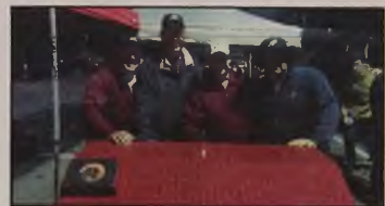
The @Elon7amTailgate crew with the grill.