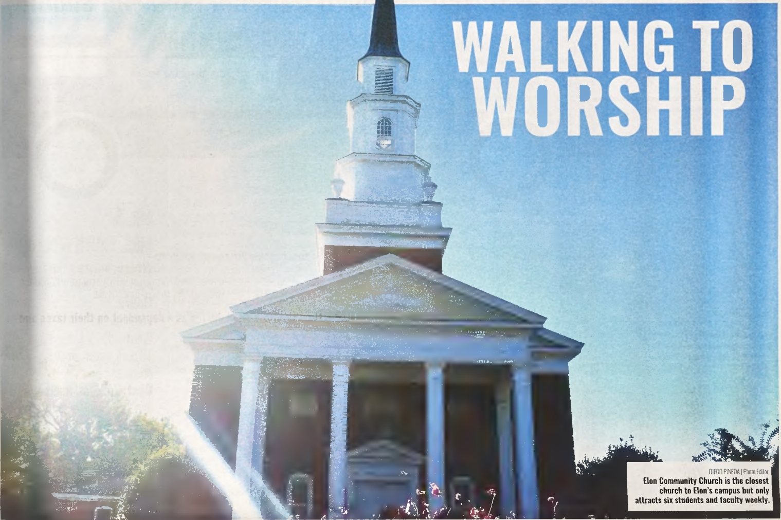
Elon Community Church is the closest church to Elon's campus but only attracts six students and faculty weekly.

Students head to churches within a mile of campus