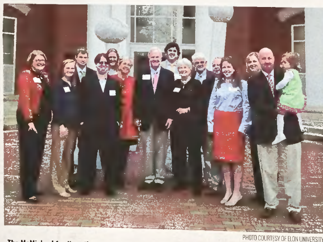
The McMichael family gathers in front of McMichael Science Center to eelebrate Founder's Day 2012.