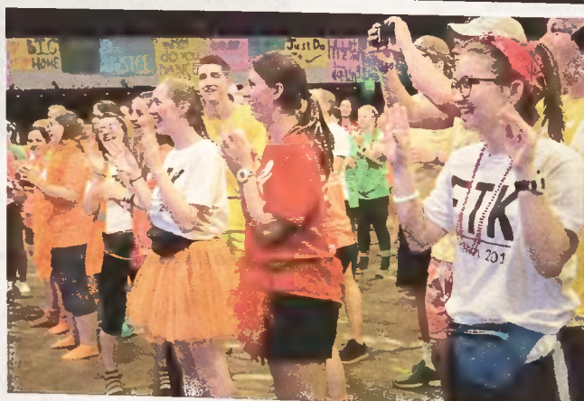
Students dance at the Elonthon fundraiser, 12 years after breaking six figures for the first time.

When Elonthon concluded at 6 p.m. April 14, the Elonthon executive team announced they had raised a total of $452,964.18 — a total of $100,000 more than last year. But this isn't the first time the fundraiser has broken records.