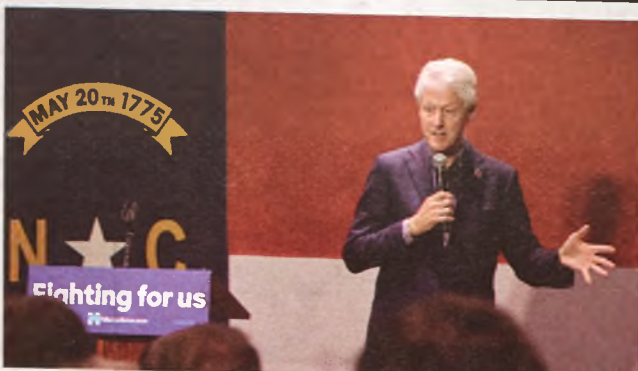
Former President Bill Clinton addresses education issues at the Elon University School of Law in an effort to garner support for his wife's 2016 presidential campaign before the North Carolina primaries.

Ten years ago, former President Bill Clinton stepped onto a stage in front of Powell to talk to both Elon University and the Alamance community. With Fonville Fountain in the background, Clinton spoke to nearly 2,000 people on behalf of his wife, Hillary Clinton, who was campaigning for the 2008 presidential election. And Bill didn't waste any breath pushing Hillary's platform before the primaries on May 6. "[Hillary Clinton] is the best change maker I have ever known, and if I had never been married to Hillary but had just known her, I'd still be working as hard for her. We just need a better system, and Hillary will give it to you," Bill said.