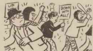
"When things go wrong, don't go with them."