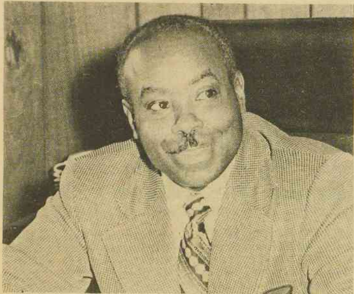
CHANCELLOR ADDRESSES '75 FALL FACULTY AND STAFF CONFERENCE