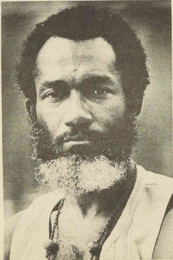
GREENLEE HERE FEB. 26 —Sam Greenlee, a black writer widely known for his book "THE SPOOK WHO SAT BY THE DOOR," will be the guest lecturer Feb. 26 in the Seabrook Auditorium. Admission is free to the public.