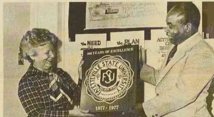
A new emblem for FSU