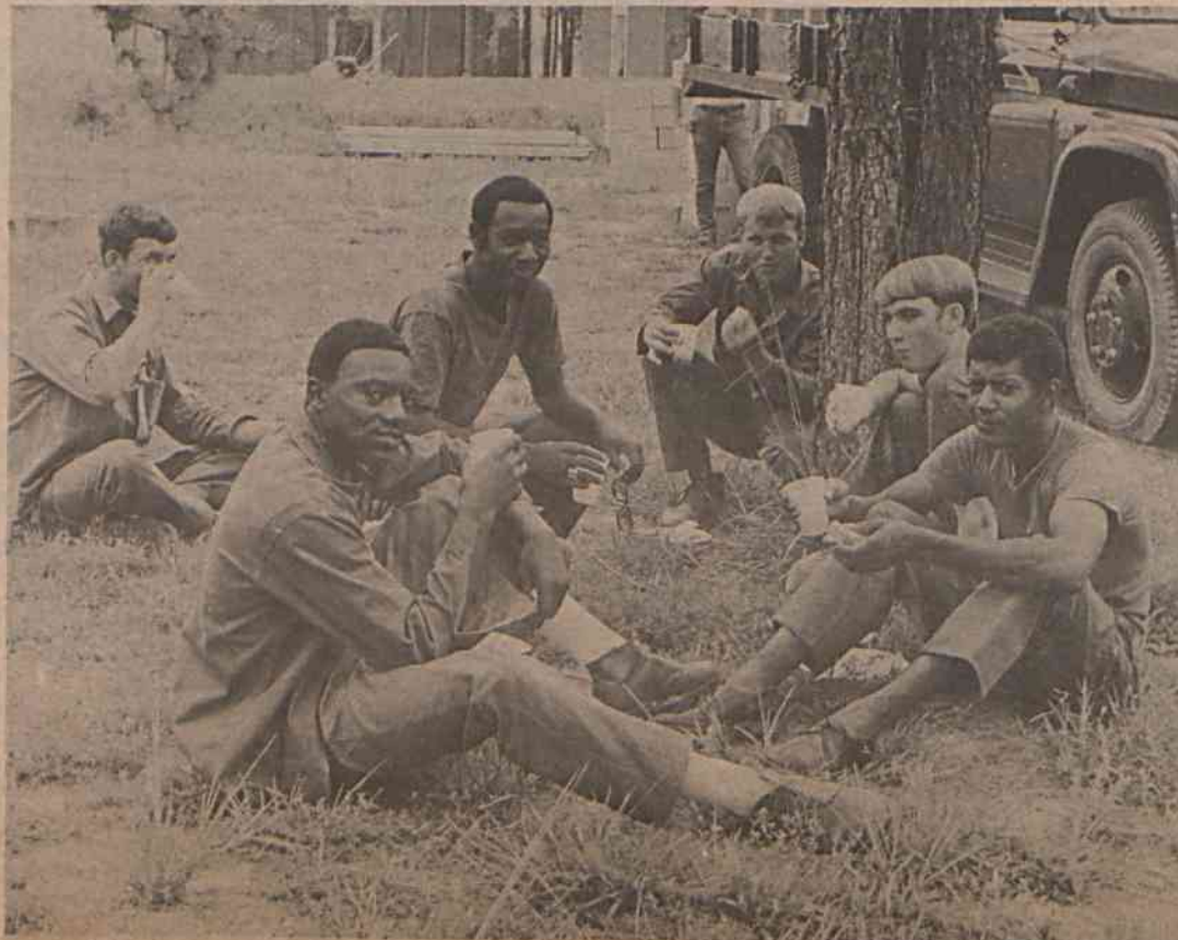
IT WAS EVEN WORTH STANDING IN LINE FOR!