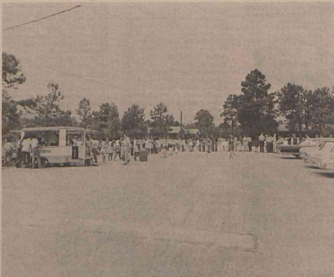
WCC'S SUMMER COOKOUT — WOW! SUCCESS AT LAST!